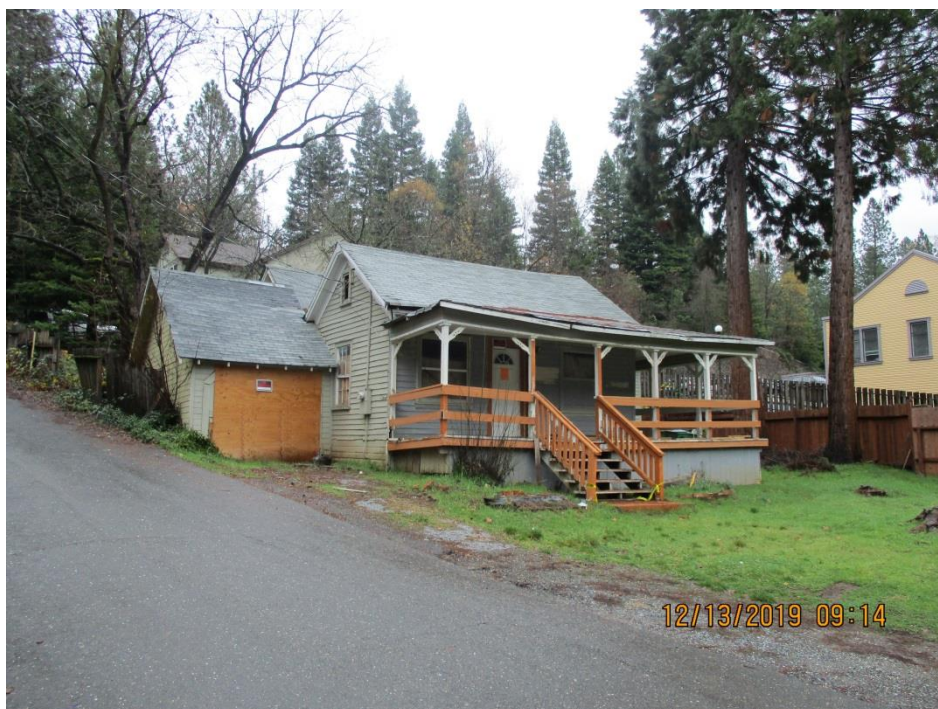
3095 Cedar Ravine Rd (front)

Overview: The applicant is seeking the demolition of this structure in order to erect a new multi-family structure.